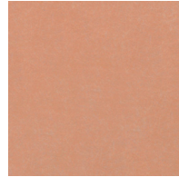
Peach - PEA