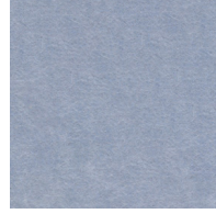
Breeze - BZE