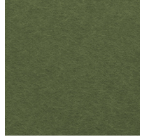
Seaweed - SWD