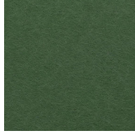
Evergreen - EVG