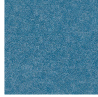
Baltic - BTC