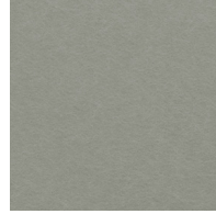
Fossil - FOS