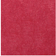
Poppy - PPY