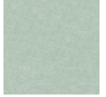
Celadon - CEL