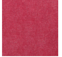
Fuchsia - FUA