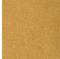
Mustard - MUS