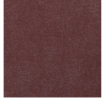
Merlot - MER